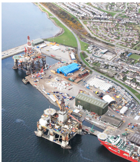
Invergordon, United Kingdom